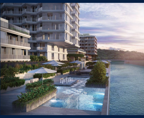
3 - Bedroom Premium