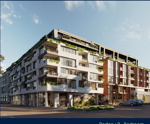
Roden: 2 - Bedroom