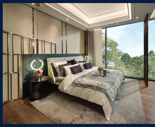
3 - Bedroom Exclusive