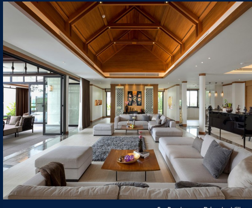
5 - Bedroom Private Villa