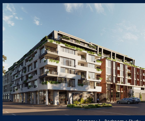
Spencer: 1 - Bedroom + Study