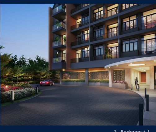
3 - Bedroom + 1