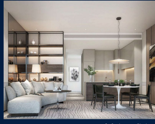
2 - Bedroom + Study