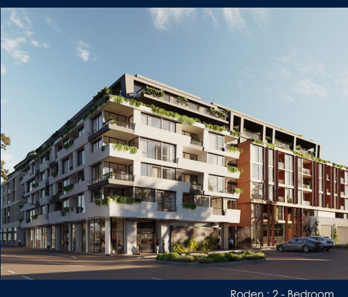
Roden: 2 - Bedroom